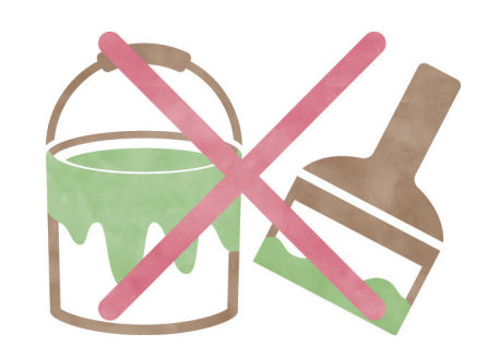
All products come with sandpaper for cleaning. By all means, clean IKONIH products together with your children.

IKONIH products are made without chemical paints, so parents can rest assured that even small children can play safely.